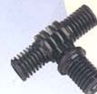
LycoFit® 3-Way Tee Fittings