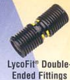
LycoFit® Double-Ended Fittings

Choose Lyall products today and start enjoying the time and money you will save.