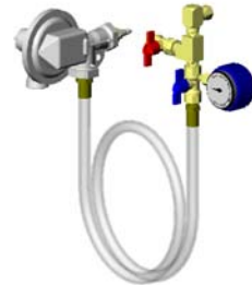
By-pass Hose Assembly