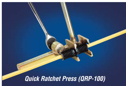
Quick Ratchet Press (QRP-100)

Complete installation instructions available at www.rwlyall.com