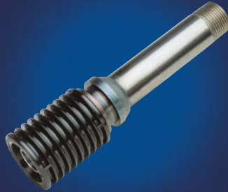
PE to Steel Transistor