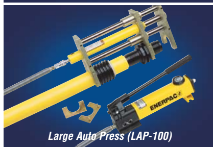
Large Auto Press (LAP-100)