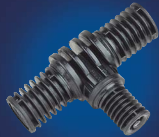
Reducer, 3-way Tee