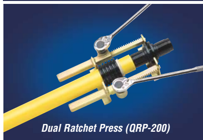
Dual Ratchet Press (QRP-200)