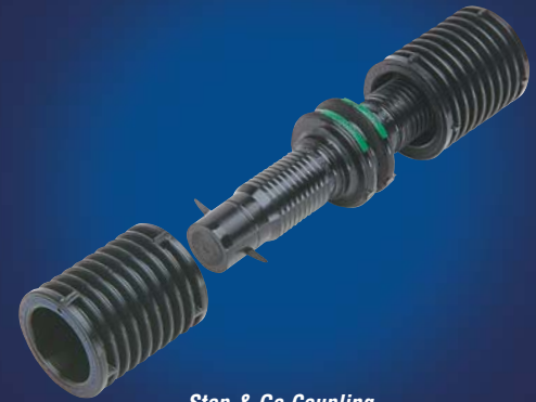
Stop & Go Coupling