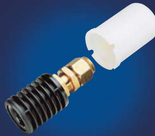
PE to Copper Tubing Adapter